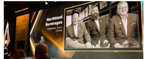
Northlands Beverages was nominated for the Donald M Kendall Award, which recognizes the best among independent Pepsi-Cola bottlers in the US and Canada. This year's awards ceremony was held on July 19 in Dallas, Texas where Pepsi-Cola of Worcester was announced as the winner.