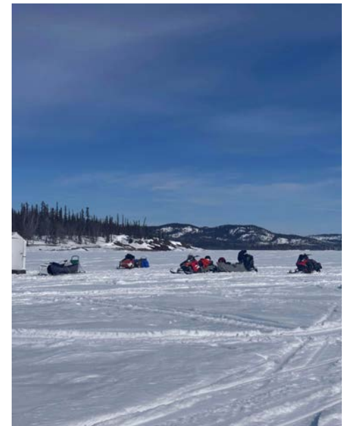
ABD supported Camsell Portage’s fishing derby this year

Black Lake and Camsell Portage held fishing derbies, and ABD purchased prizes from Tru North, who provided a significant discount. Additionally, QM Points and Points Athabasca also donated $1,000 in prizes.