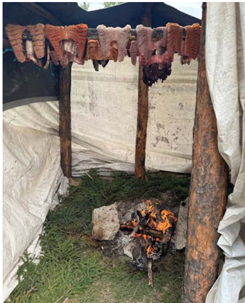
Filleted fish are smoked for hours.

I had never seen a fish cooked whole like that before. In my urban world, meat always came cut in neat and tidy pieces, ready to cook and wrapped in plastic, not resembling the animal when it was alive. While I couldn't help but notice the fish seemed to stare at me, the smell was amazing. My eager stomach growled.